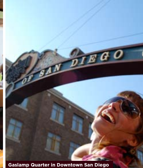
Gaslamp Quarter in Downtown San Diego