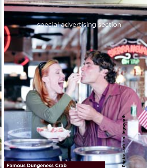
Famous Dungeness Crab