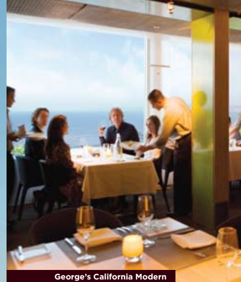
George's California Modern