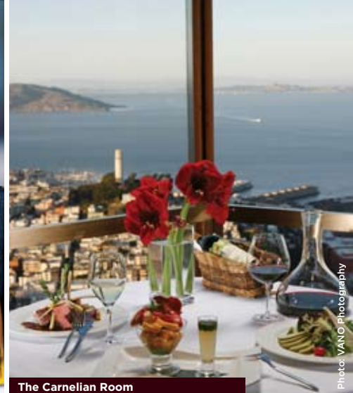
The Carnelian Room