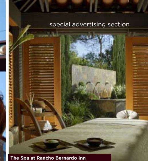
The Spa at Rancho Bernardo Inn