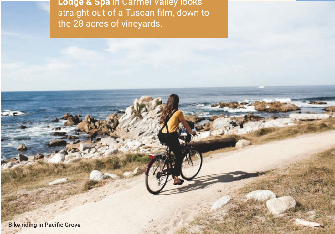
Bike riding in Pacific Grove

The Monterey Peninsula features many noteworthy accommodations. Famous for golf and their location along the peninsula, Pebble Beach Resorts offer boutique hotel rooms, private cottages, and apartments between three properties. La Playa Hotel is the briefest of strolls from the beach in Carmel-by-the-Sea. Inland, Bernardus Lodge & Spa in Carmel Valley looks straight out of a Tuscan film, down to the 28 acres of vineyards.