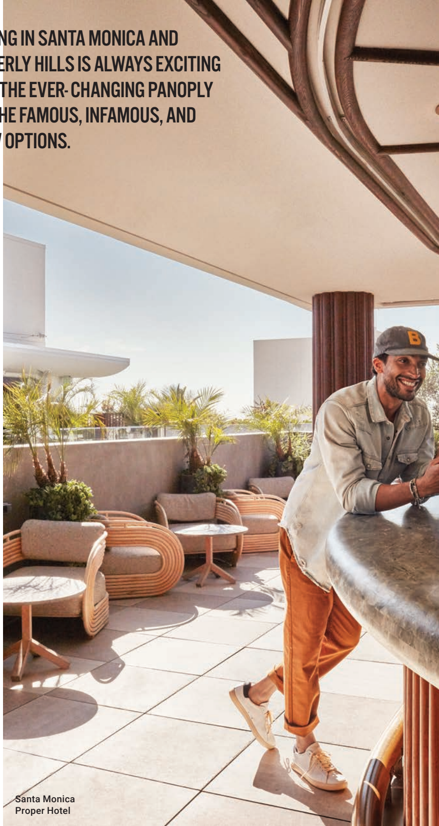
Santa Monica Proper Hotel

DINING IN SANTA MONICA AND BEVERLY HILLS IS ALWAYS EXCITING FOR THE EVER-CHANGING PANOPLY OF THE FAMOUS, INFAMOUS, AND NEW OPTIONS.