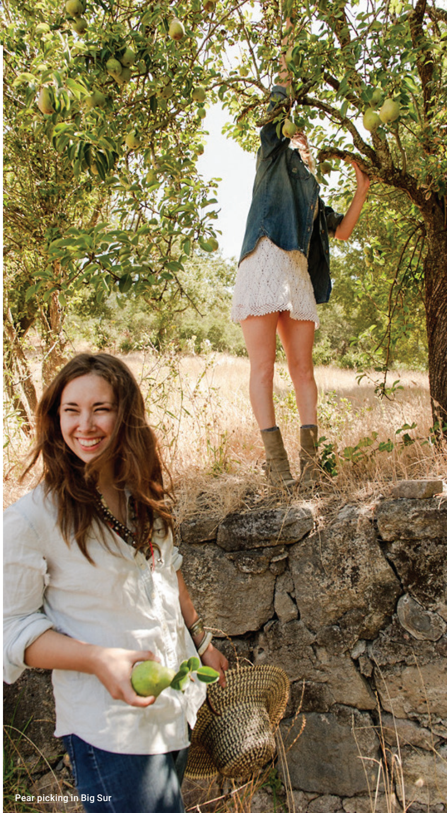
Pear picking in Big Sur

At Alila Ventana Big Sur , supremely comfortable suites seemingly mesh with nature. Those with private hot tubs are particularly dreamy. Or enjoy a room equipped with an oversize hammock and wood-burning fireplace. Sit back for the three-hour prix-fixe menu in the hotel's Glass House , gazing out from the ocean's edge. An iconic Big Sur resort, the Post Ranch Inn has rooms that offer a range of panoramas—ocean, forest, and mountain. Watching the sun melt into the sea from a glass-walled bungalow or sleeping in a grown-up treehouse with a skylight for stargazing make for unforgettable moments. At night, guests can slip into the infinity pool overlooking the Pacific. ■