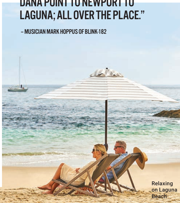
Relaxing on Laguna Beach