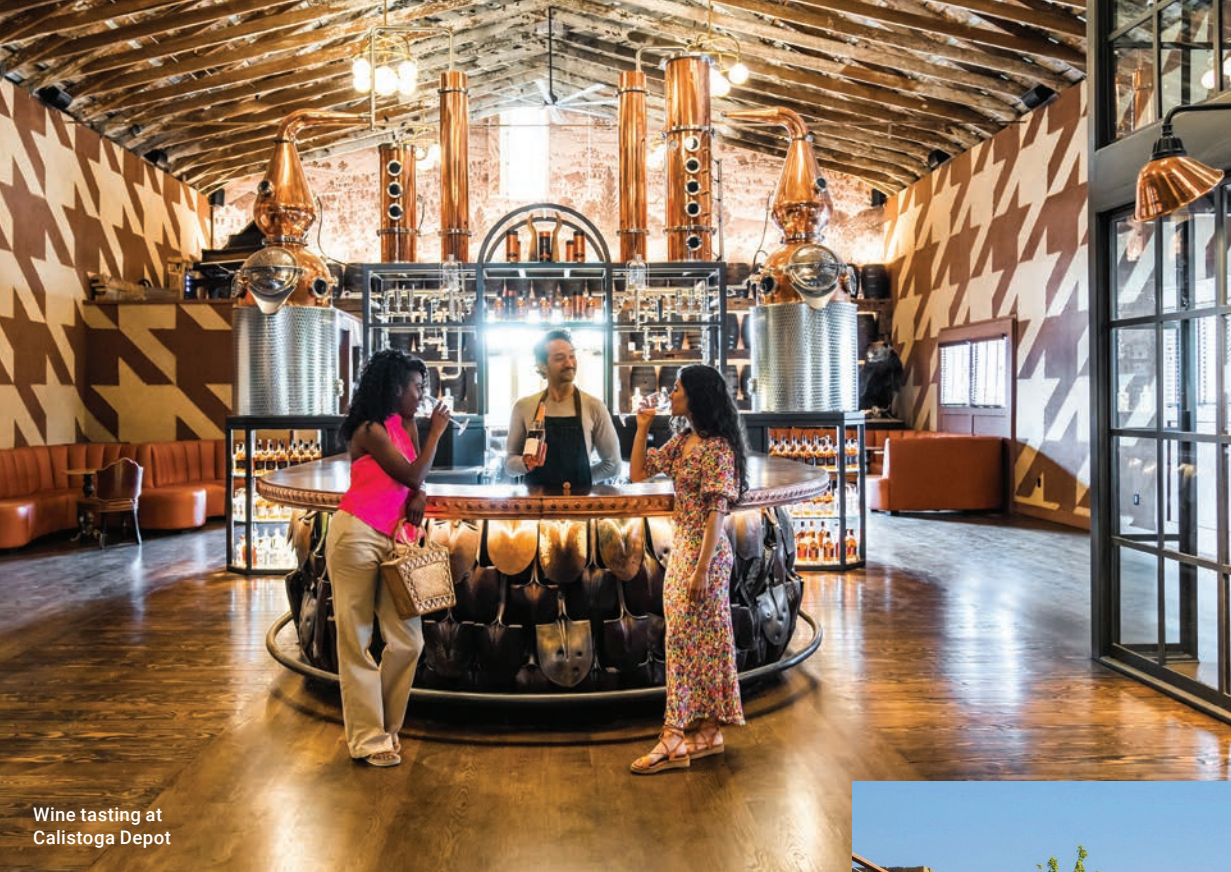
Wine tasting at Calistoga Depot