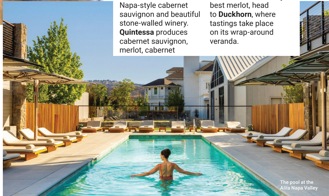
The pool at the Alila Napa Valley

Close to St. Helena , a town in the heart of the Napa wine region where it's easy to get around on two feet, Alila Napa Valley has an intimate collection of rooms and suites surrounded by historic wineries, including the vaunted vines of Beringer Vineyards . Relax on a private balcony or terrace, some with personal firepits. For some of the valley's best merlot, head to Duckhorn , where tastings take place on its wrap-around veranda.