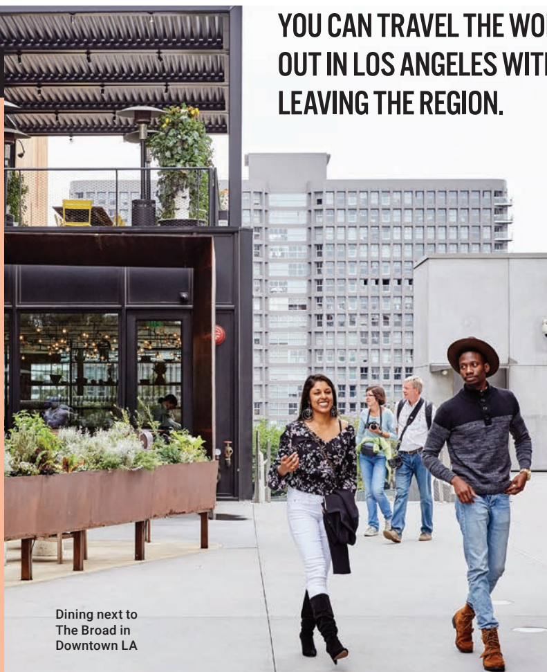
Dining next to The Broad in Downtown LA

Top fashion houses are fueling a hot new shopping trend in the city: landmark stores with appointment-only showings of their collections. The Gucci Salon on iconic Melrose Place is among the many other boutiques to peruse. Also, check for the latest location of Louis Vuitton's exclusive pop-up showroom, which is usually found at an unmarked Bel Air estate.