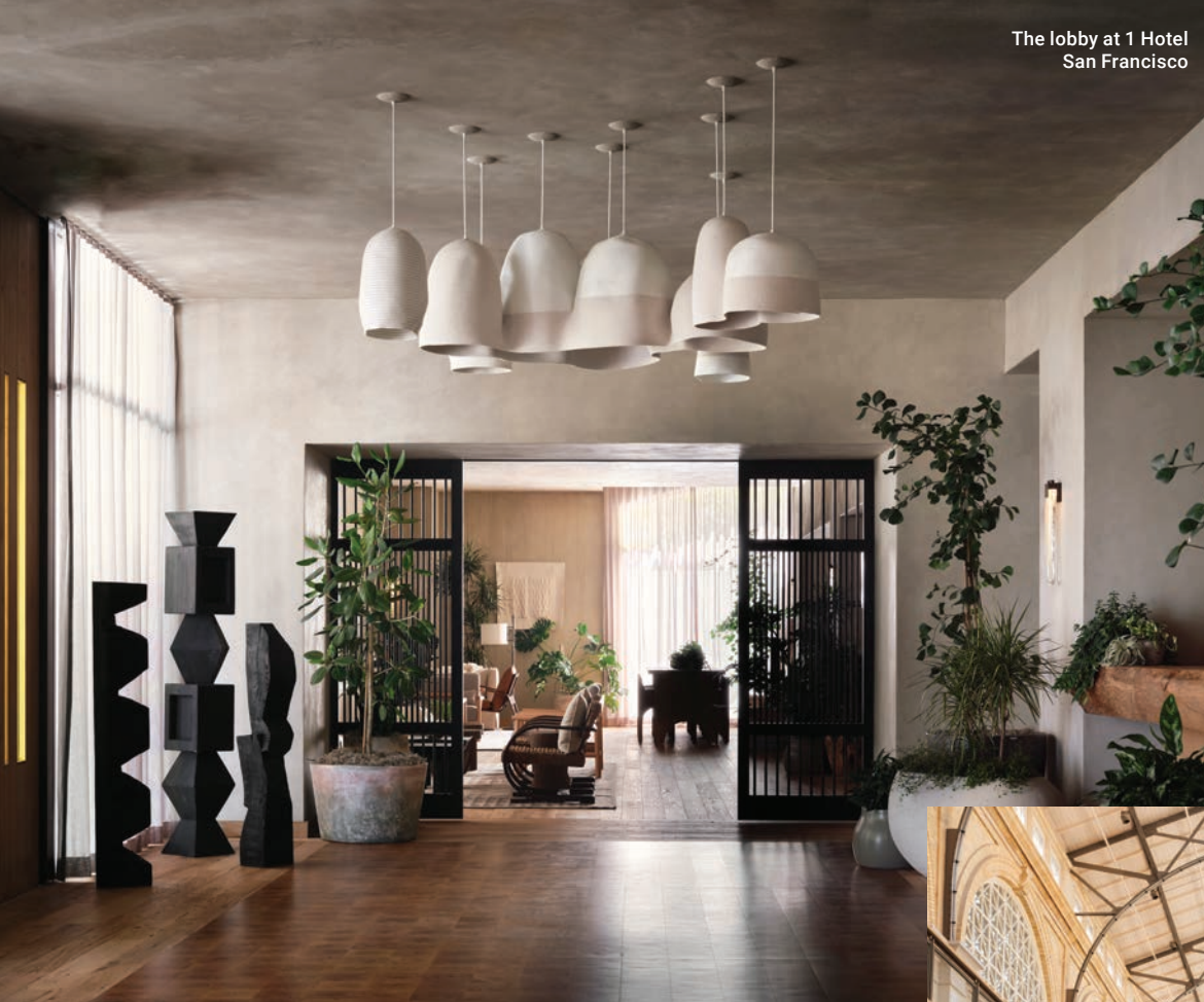
The lobby at 1 Hotel San Francisco

of what was once Fort Baker . In addition to views and walks, the resort offers Farley , a sophisticated bistro, and a spa.