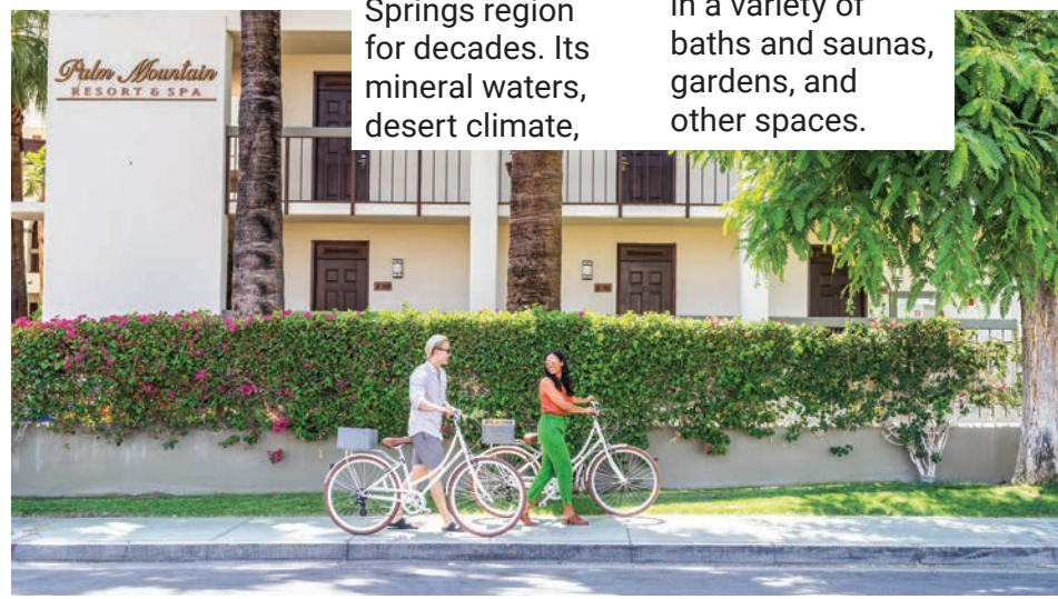
Cycling at the Palm Mountain Resort & Spa