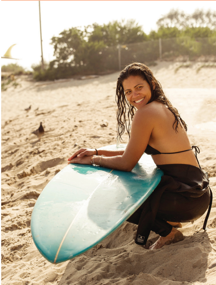
Surfing in Los Angeles

Los Angeles is one of the most dynamic travel destinations in the world. For starters, among its myriad pleasures, what can compare to Hollywood ? And with proper planning, anyone can enjoy the star treatment from Downtown to West Hollywood .