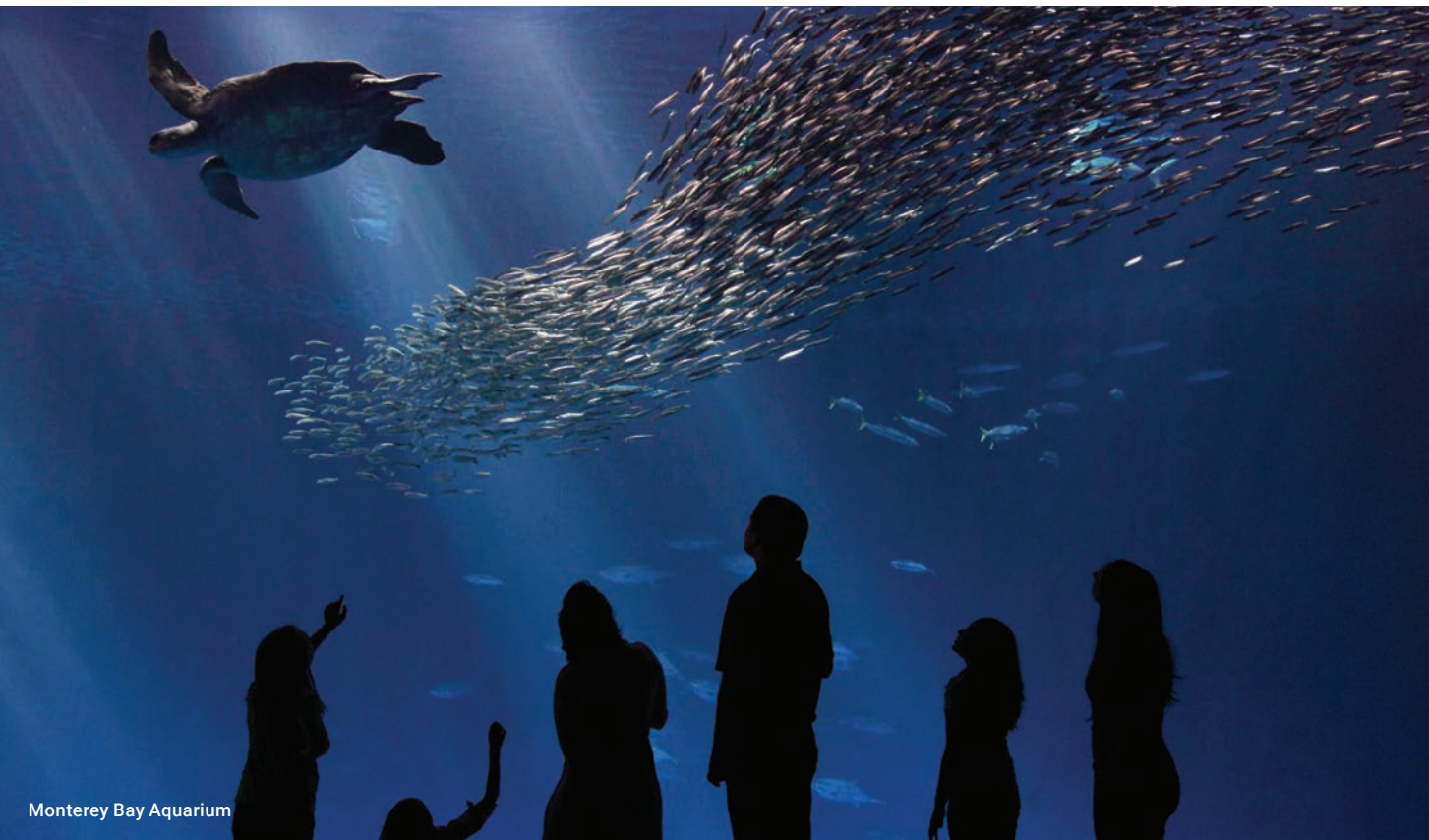
Monterey Bay Aquarium

Memorable eating, with ingredients sourced locally from land and sea, is a hallmark of the region. In Monterey proper, the Monterey Bay Aquarium can easily fill a day with its world-class aquatic displays, from the mesmerizing kelp forest to the ever-lovable sea otters. (The aquarium publishes an essential guide to sustainable seafood, too.) The Sardine Factory recalls the fishing heritage of