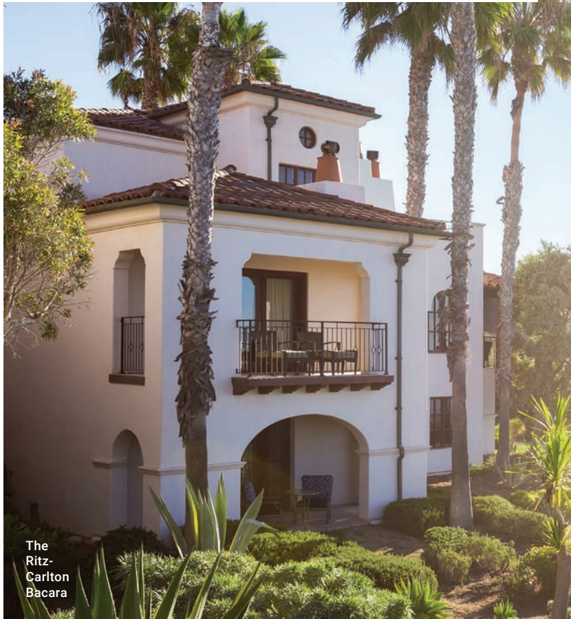
The Ritz-Carlton Bacara

the rooftop pool to suites with fireplaces. Montecito , the exclusive enclave to the south, is home to the 500-acre San Ysidro Ranch , a fabled resort that dates to the 1890s and includes the vast suite where John and Jackie Kennedy once honeymooned. Nearby, Rosewood Miramar Beach is another top choice and features Caruso's , a Michelin-starred restaurant with beautiful ocean views. ■