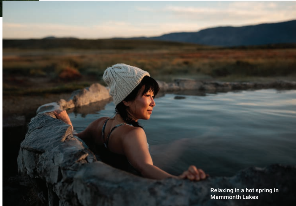
Relaxing in a hot spring in Mammoth Lakes

Named for the Indigenous Mono people, the Westin Monache Resort is ideally situated to take full advantage of this spectacular spot. Studios and suites include fireplaces and kitchens. The rustic Mogul Restaurant is known for its prime rib. ■