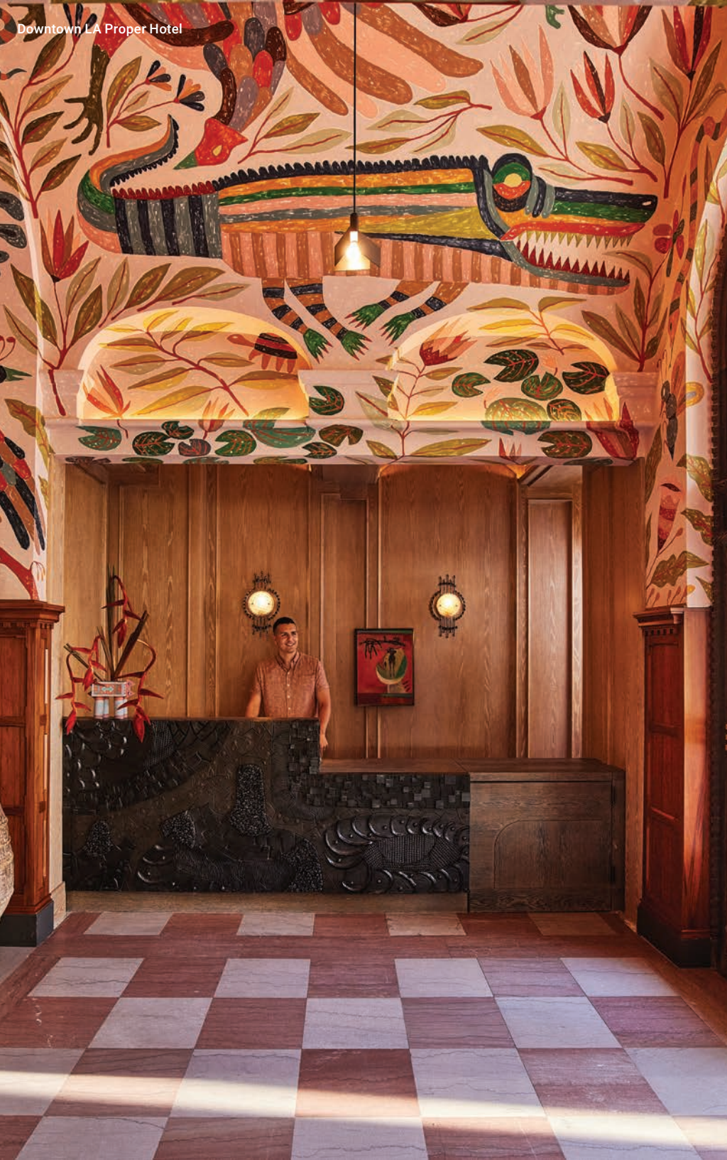
Downtown LA Proper Hotel

into the Sunset Marquis in West Hollywood—the all-suites hotel has its own recording studio for guests. The Art Deco masterpiece Sunset Tower Hotel is an understated spot popular with celebrities. Suites have views across West Hollywood.