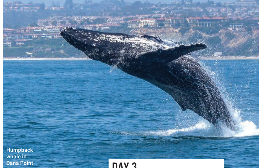
Humpback whale in Dana Point

Balboa Bay Resort , on the labyrinthine body of water that defines much of Newport Beach, offers rooms with nautical vibes and guests can rent sailboats or get lessons on the channel. Plus, the curated beach picnic is a memorable treat. Nearby, one of The OC’s top restaurants, Costa Mesa’s Vaca , specializes in Spanish cuisine with Japanese twists.