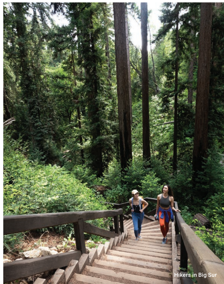
Hikers in Big Sur