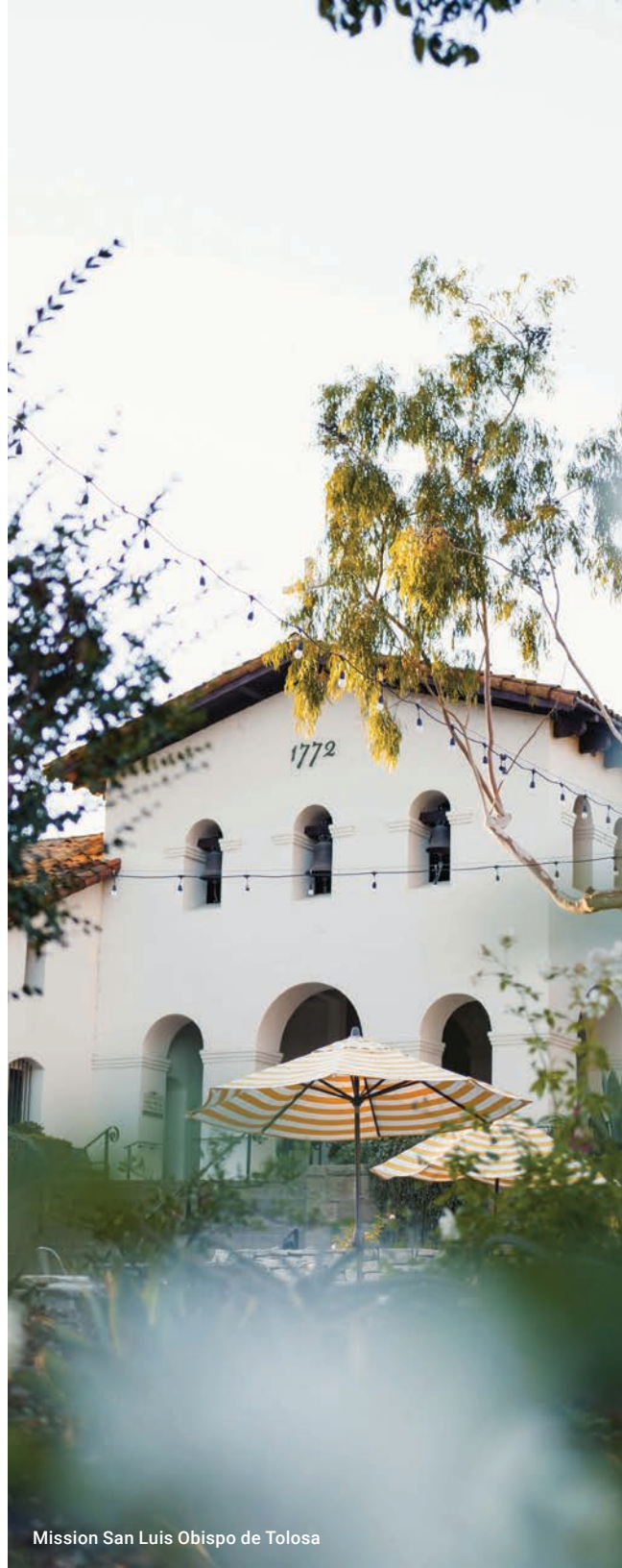
Mission San Luis Obispo de Tolosa

Among the top eateries in a destination full of exceptional restaurants, San Luis Obispo's Buona Tavola dishes up Italian specialties with local flair. Book a table on the covered garden patio. Before and after, stroll the downtown with its shops, galleries, and beloved Thursday evening Farmers Market .