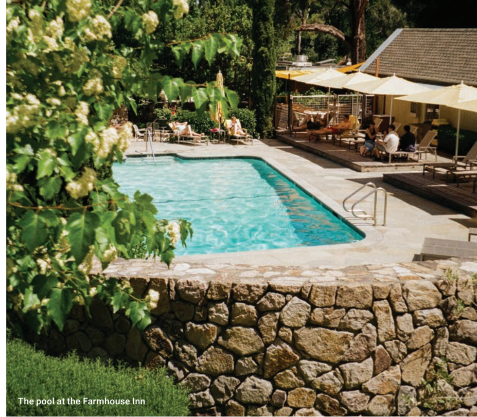
The pool at the Farmhouse Inn

not found in Italy, France, or anywhere else on the planet—Steinbeck celebrated the soaring trees of California's coastal redwood groves for their "silence and awe." Stand in wonder at Armstrong Redwoods State Natural Reserve just north of the village of Guerneville . Continue up the Pacific Coast Highway (a.k.a. PCH or Highway 1), stopping to sample superbly fresh oysters and crab. ■