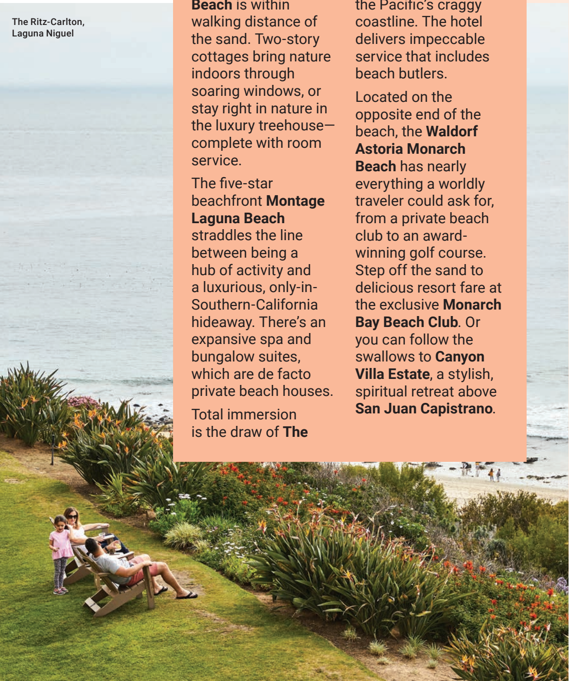
The Ritz-Carlton, Laguna Niguel

Located on the opposite end of the beach, the Waldorf Astoria Monarch Beach has nearly everything a worldly traveler could ask for, from a private beach club to an award-winning golf course. Step off the sand to delicious resort fare at the exclusive Monarch Bay Beach Club . Or you can follow the swallows to Canyon Villa Estate , a stylish, spiritual retreat above San Juan Capistrano .