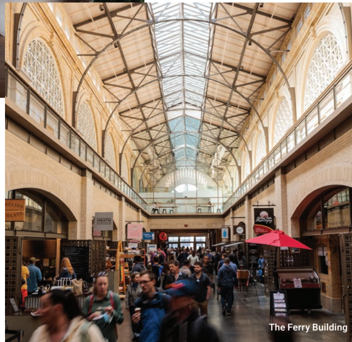
The Ferry Building

Cavaña , with bay and city views from the 17 th floor. Just across the Golden Gate Bridge—and boasting the Bay Area's best vantage point of the bridge's span— Cavallo Point is an anchor of the national recreation area. Fronted by a wide lawn stretching down to the bay, it has well-appointed guest rooms, some in former officer's quarters