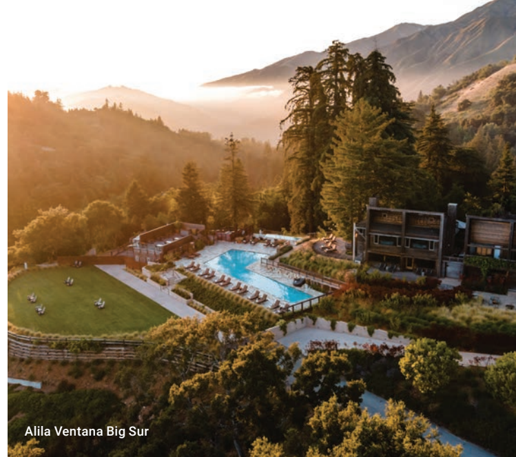
Alila Ventana Big Sur