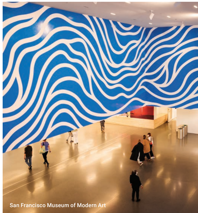
San Francisco Museum of Modern Art