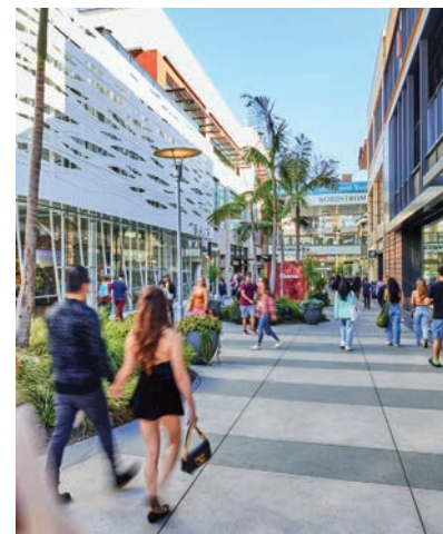
Third Street Promenade

property, the Hotel Casa Del Mar , has been a touchstone in the community since 1928. The Italian Renaissance style, completely unlike the surrounding architecture, makes for a lovely residential-feeling environment.