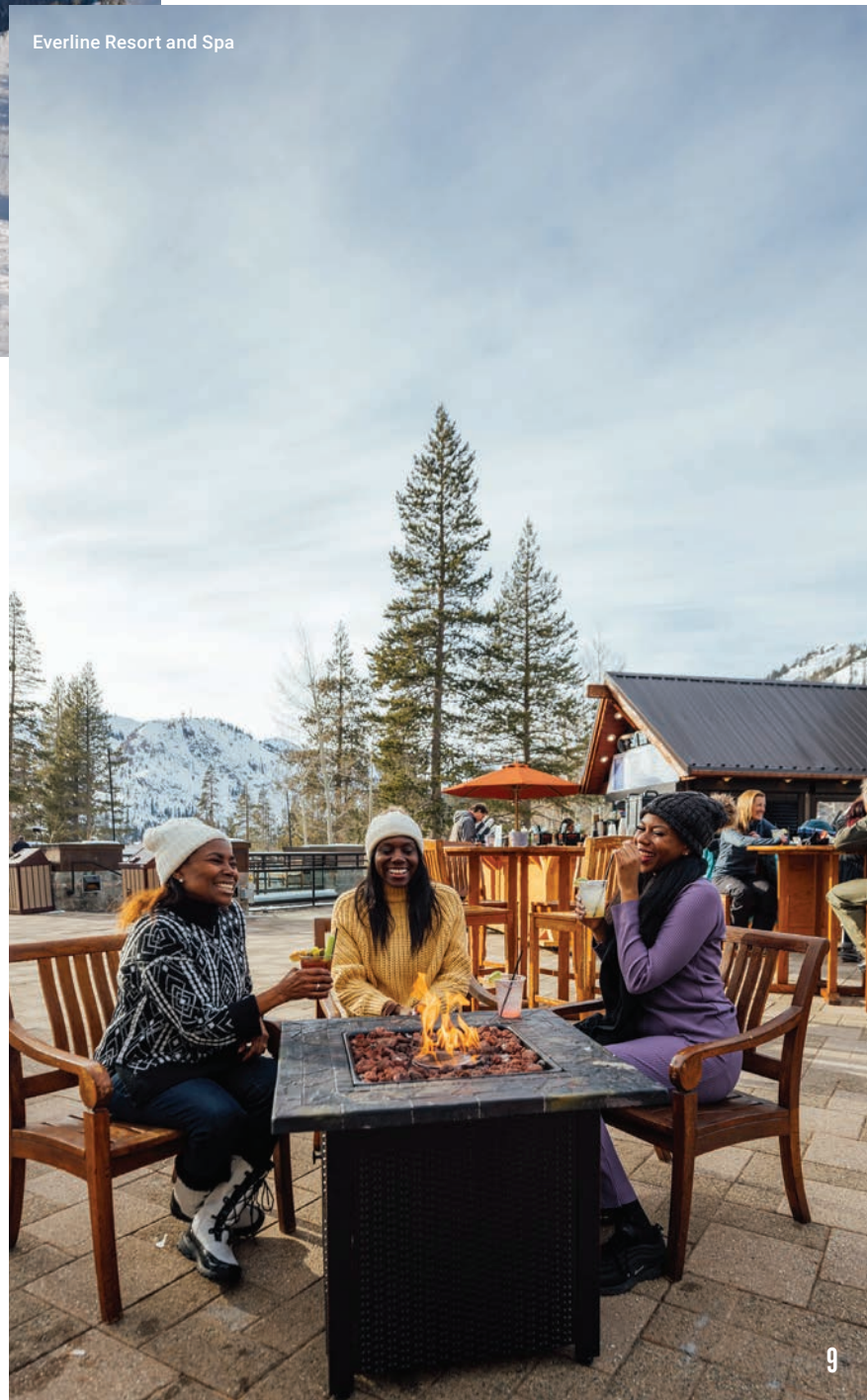
Everline Resort and Spa

Nearby, the lifts are steps away from PlumpJack Inn . Its 56 rooms and intimate suites are within one of the world's most popular ski resorts. Catch the vibe around the outdoor pool or on the sunny deck at the neighboring Le Chamois , a welcoming bistro and bar.