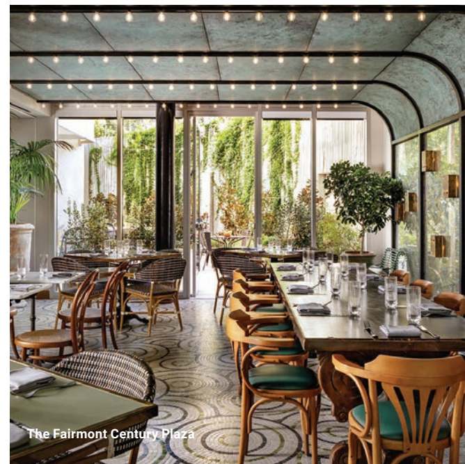
The Fairmont Century Plaza

The London West Hollywood's personality is one part laid-back Californian, one part British aristocrat. Nowhere is that clearer than at the 10 th -floor rooftop pool, where plantings inspired by formal English gardens stand out against a backdrop of palm trees and the Hollywood Hills . A penthouse designed by fashion legend Vivienne Westwood occupies the top floor. No need to record a hit single before checking