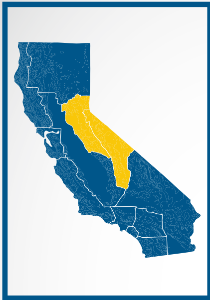
High Sierra/ Gold Country