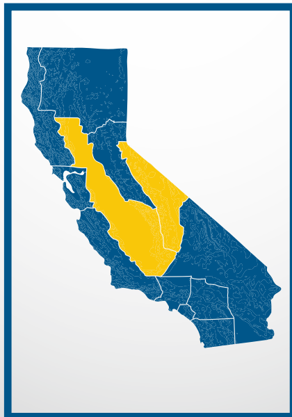
Central Valley/ High Sierra